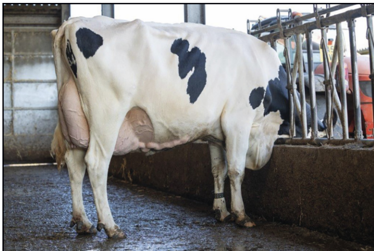
HOLLAFRENCH PEPPER SWALLOW 32 SP, (Ex-90) Lot 57

She was maternal sister to the 10,162kg 4.47% (3.12) Hollafrench Steady Swallow 14 (Ex-90). Her dam was the 11,771kg 3.69% (3.36) Hollafrench Principal Swallow 5 LP80, SP, (Ex-91-3); gd was the 11,595kg 3.72% (2.98) Hollafrench Italie Swallow 2 LP50, SP, (VG-85); 3d was the 10,285kg 3.74% (3.07) Coldridge Juror Swallow 3 2*, (Ex-90); 4d was the 9,842kg 3.66% (3.44) Cherry Crest HHL Swallow RM, (VG-89).