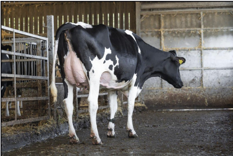
HOLLAFRENCH ALUM LORNA 91 (VG-86)

Her dam is the 8,342kg 3.64% (3.28) Hollafrench Zelgagis Lorna 75); gd was the 12,497kg 3.15% (3.14) Hollafrench One Lorna 65 (VG-85); 3d was the 11,616kg 4.04% (3.00) Hollafrench Shaker Lorna 56 LP70, SP, (Ex-91); 4d was the 10,348kg 4.37% (3.13) Hollafrench Bench Lorna 49 4*, SP, (GP-84).