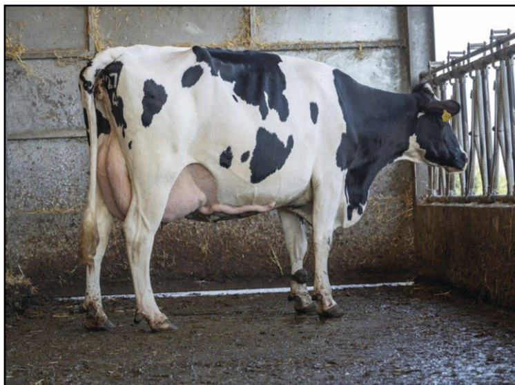
HOLLAFRENCH APPRENTICE LORNA 88 (VG-89) Lot 46

Her dam was the 11,616kg 4.04% (3.00) Hollafrench Shaker Lorna 56 LP70, SP, (Ex-91); gd was the 10,348kg 4.37% (3.13) Hollafrench Bench Lorna 49 4*, SP, (GP-84).