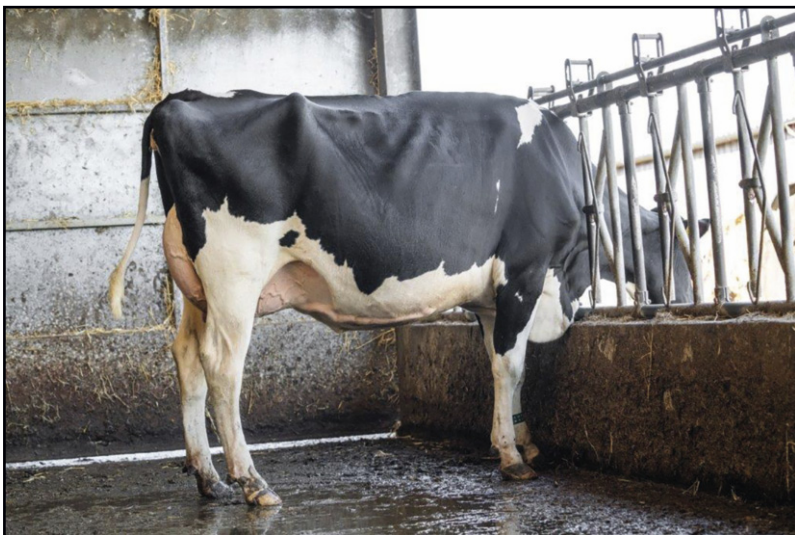
HOLLAFRENCH REMEDY EX113 Lot 106

She is maternal sister to the 12,515kg 3.96% (3.08) Hollafrench Barman EX90 SP, (Ex-91-2), dam lot 30. Her dam is the 11,239kg 4.12% (2.86) Hollafrench Shottle EX81 SP, (VG-85); gd was the 14,598kg 3.14% (2.83) Hollafrench Baxter EX64 2*, SP, (Ex-90); 4d was the 10,842kg 4.17% (3.13) Hollafrench Capri EX39 LP60, (VG-86).