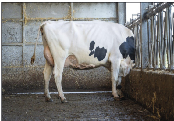
HOLLAFRENCH PURSUIT DREAMER 16 (VG-86)

She is maternal sister to the 10,639kg 4.22% (3.36) Hollafrench Upright Dreamer 10 SP, (VG-88), lot 21 and to the 9,915kg 3.63% (3.35) Hollafrench Ross Dreamer 3 (VG-88). Her dam was the 12,052kg 3.99% (3.18) Hollafrench Mascol Dreamer 2 LP80, SP, (Ex-92-4), dam lot 21; gd was the 11,155kg 3.99% (3.13) Dinnaton Matt Storm Dreamer LP70, SP, (Ex-91-3); 3d was the 10,907kg 3.71% (3.18) Dinnaton Chair Matt Dreamer A ET (VG-85); 4d was the 16,642kg 3.3% (2.9) Loganway Chairman Dreamer (Ex-93); 5d was the 11,993kg 4.1% (2.9) Loganway Bell Dream (Ex-90).